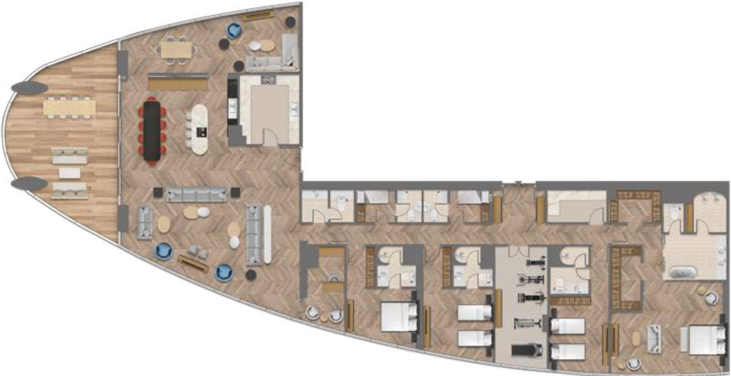
4 BEDROOM APARTMENT, SIMPLEX