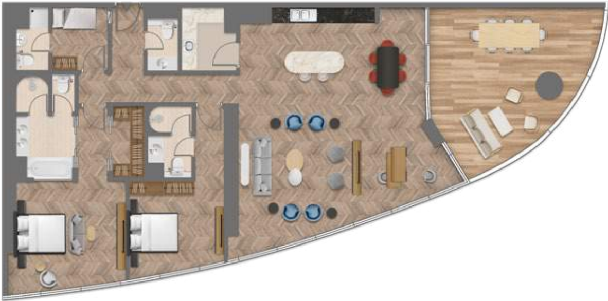
2 BEDROOM APARTMENT, TYPE B