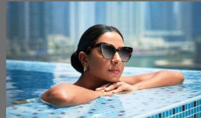
Lifestyle & Experiences