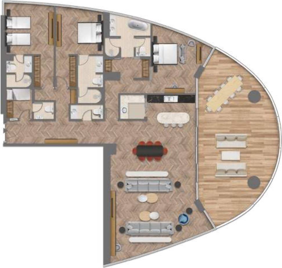
3 BEDROOM APARTMENT, TYPE B