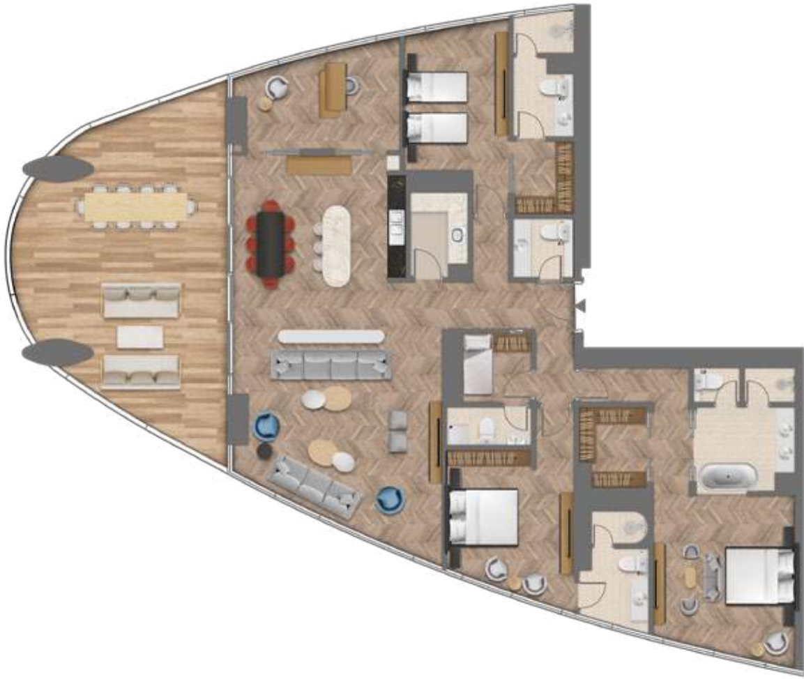
3 BEDROOM APARTMENT, TYPE A