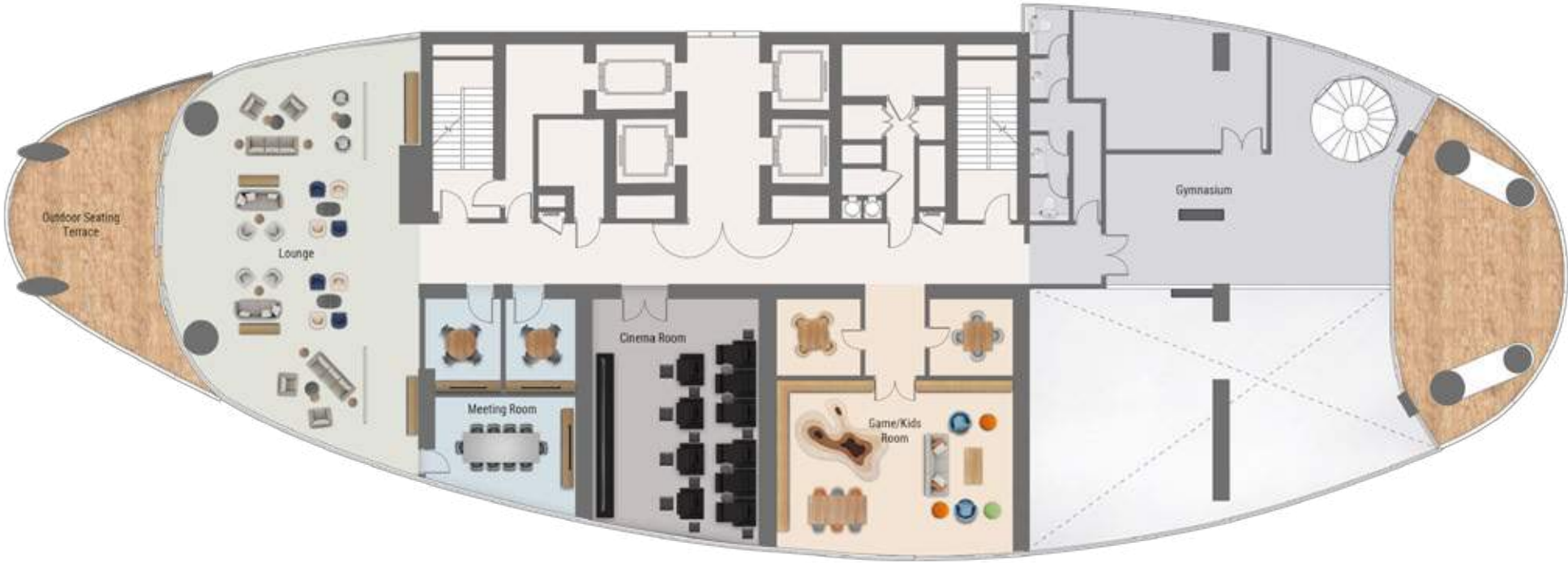
AMENITIES, PODIUM LEVEL 5