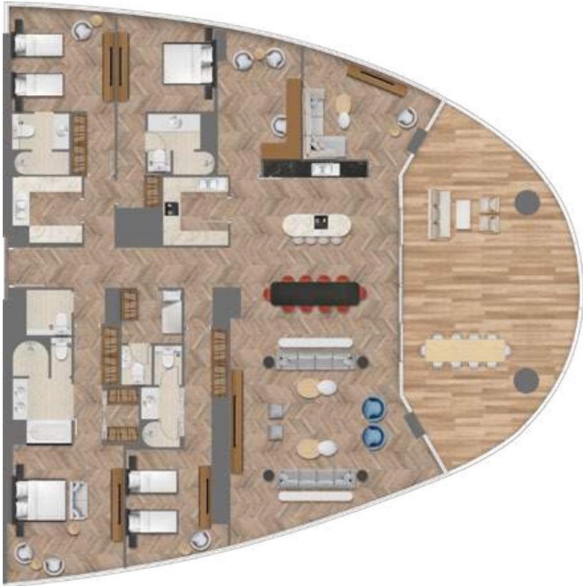
4 BEDROOM APARTMENT, TYPE A