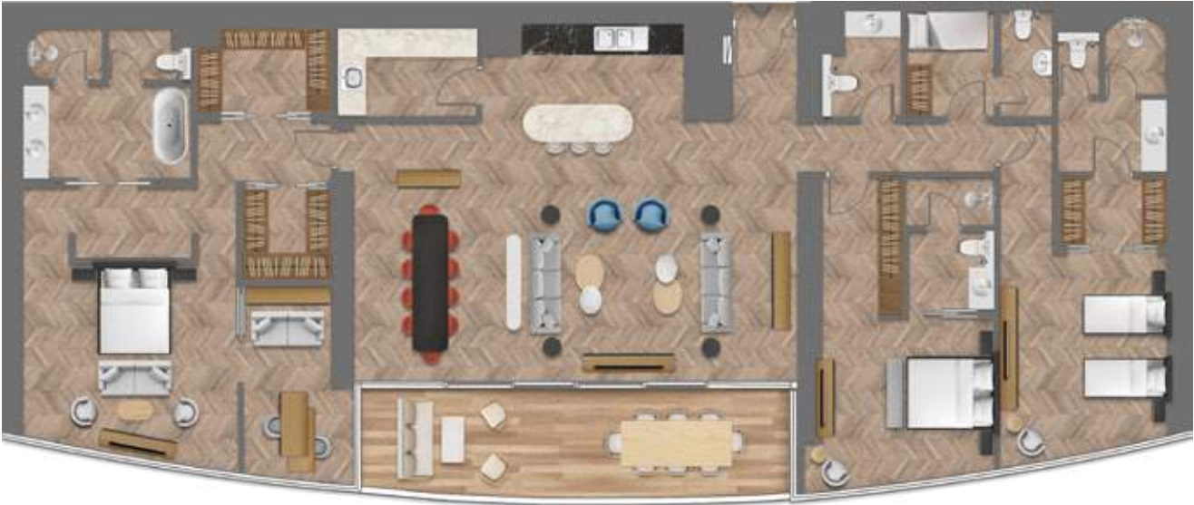
3 BEDROOM APARTMENT, TYPE C