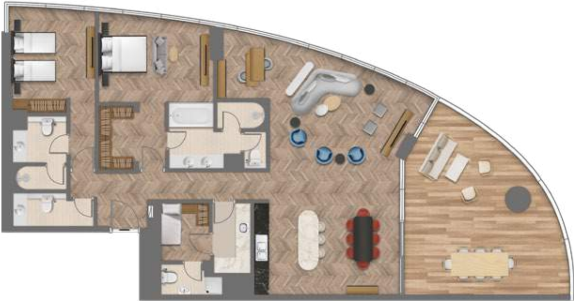
2 BEDROOM APARTMENT, TYPE A