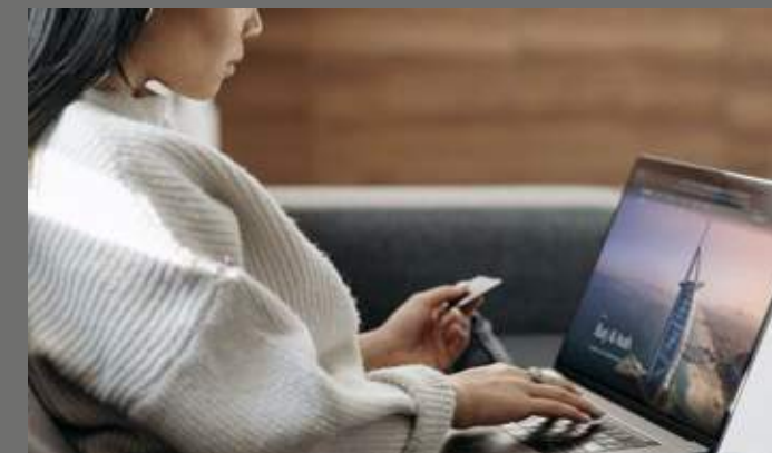
Pay with Points