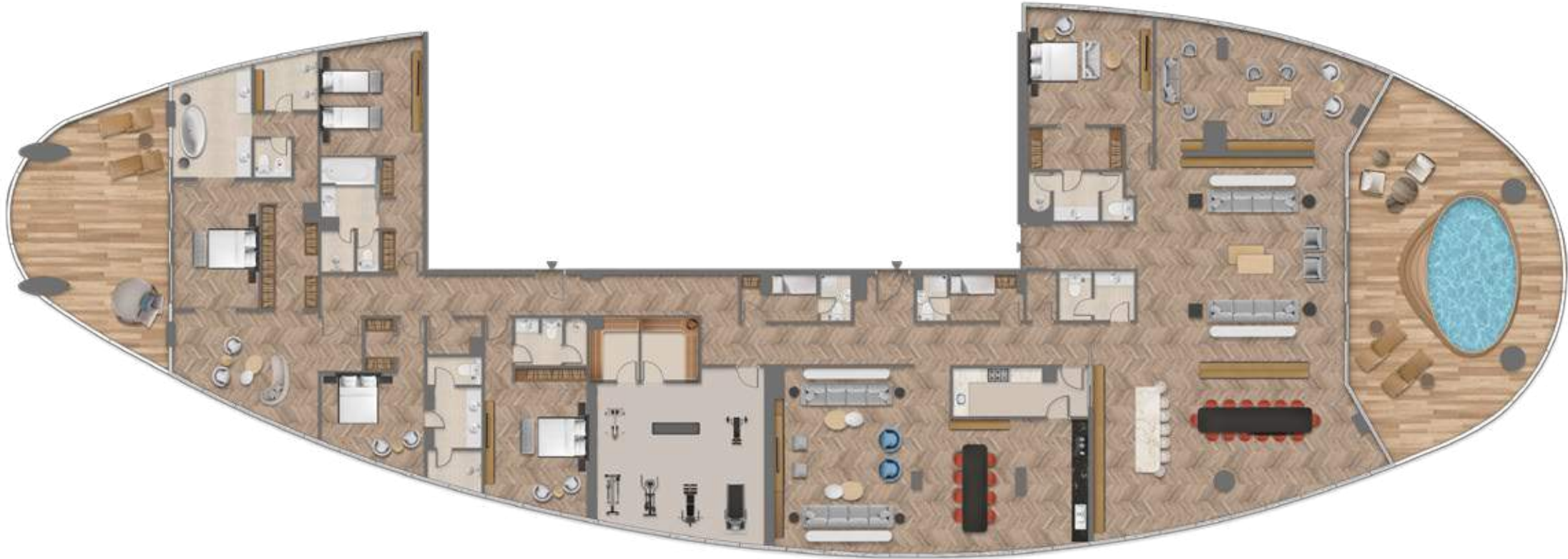
5 BEDROOM FULL FLOOR PENTHOUSE