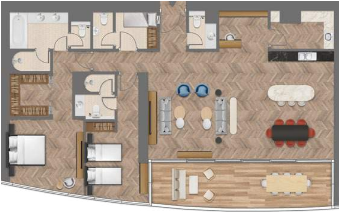
2 BEDROOM APARTMENT, TYPE C