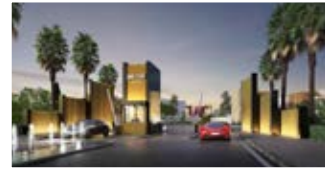
1. COMMUNITY GATE